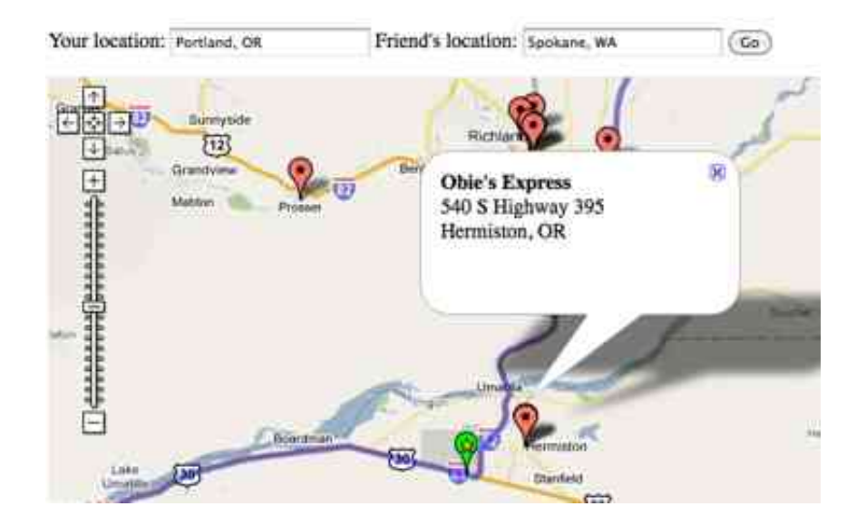
To Help You On Your Way To Using Mapstraction, We'll Simply Create A Map We Can Display On A Web Page, And Then Add A Marker To Denote A Particular Location